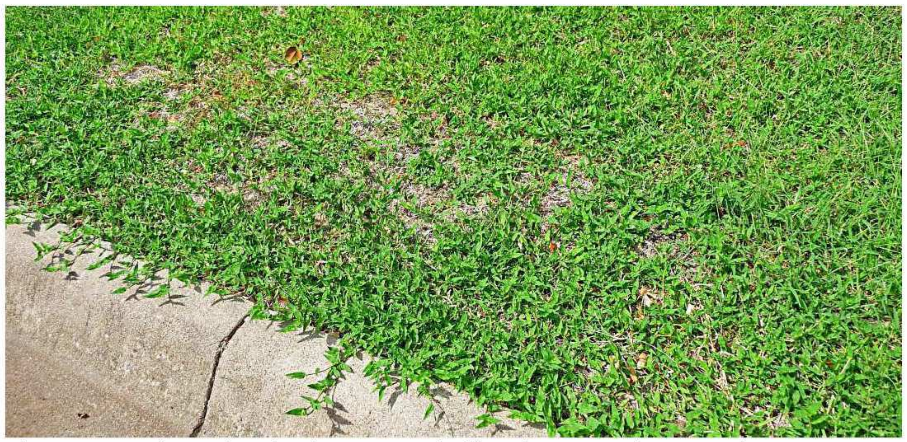
Figures 1–5. Arthraxon hispidus along street curb of lawn in Fort Worth, Texas. Photos 14 August 2011.